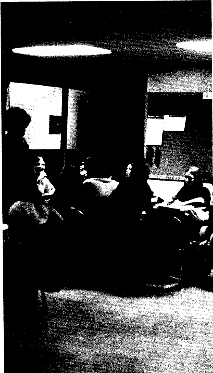
Students gather in lounge to plan activities